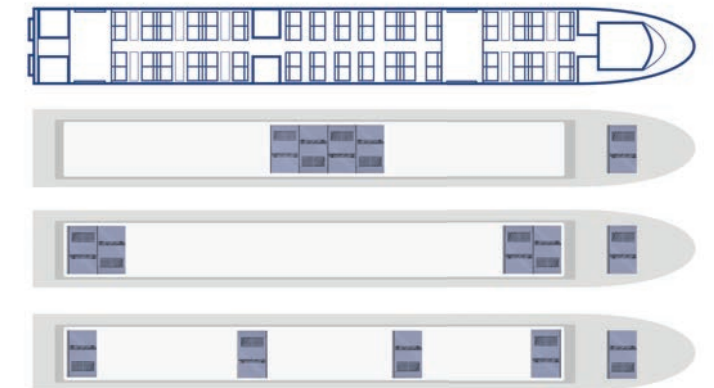
Flexible configuration of the MACS 8.0 modules

Liebherr is developing CO 2 -cooled modules with identical interfaces. The modular architecture of MACS 8.0 enables a small-cycle CO 2 concept, which is easy to maintain and safe in operation.